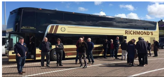
A sunny Anglesey and we're on time for the ferry