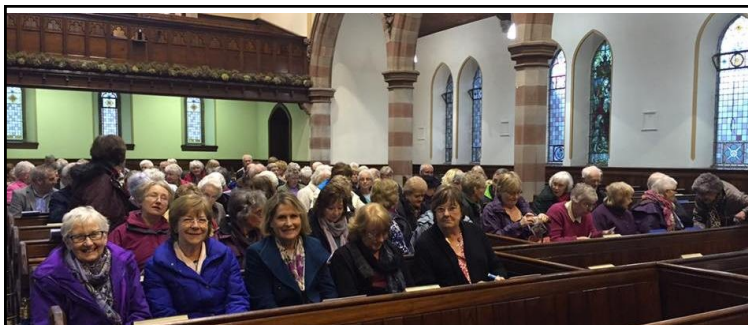
Suffolk supporters fill the front rows in St John's Church, Newtownbreda in anticipation of another fine concert