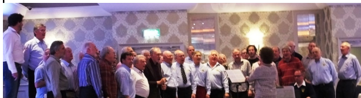
Last songs in Ireland