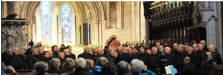
Lunchtime recital, St Patrick's Cathedral, Dublin